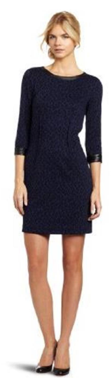
DKNYC Women's Ponte Leopard 3/4 Sleeve Dress, Indigo