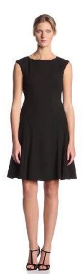
Calvin Klein Women's Cap Sleeve Solid Flare Dress